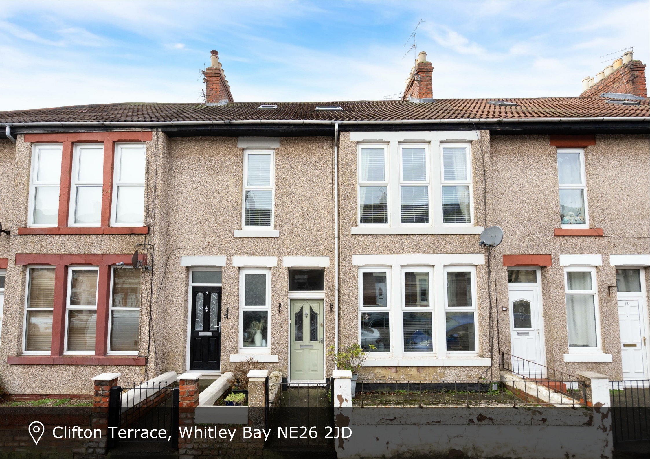
📍 Clifton Terrace, Whitley Bay NE26 2JD